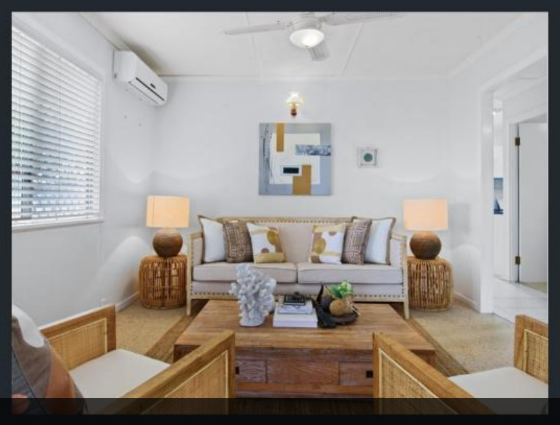
161 Dawson Rd, Upper Mount Gravatt