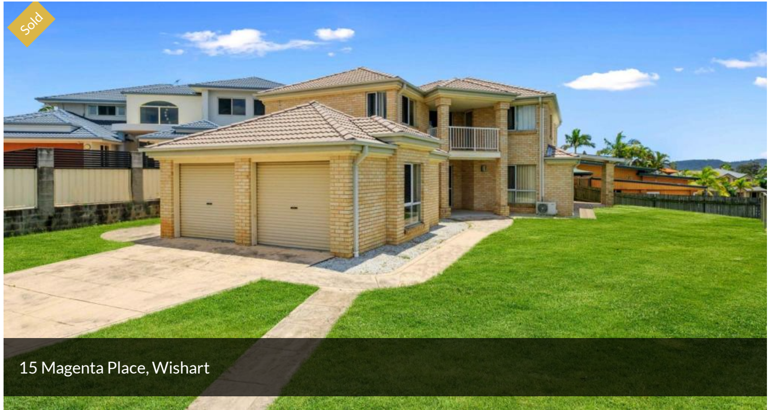
15 Magenta Place, Wishart