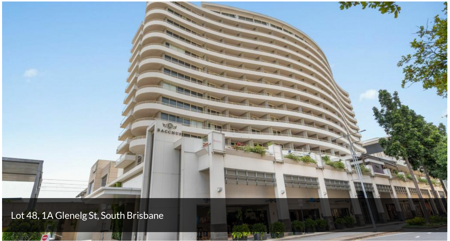
Lot 48, 1A Glenelg St, South Brisbane